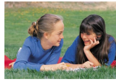
Do you have a friend you would like to bring along to try a class for FREE?