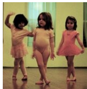
NOT like this!

all other dance classes should have hair securely tied back off the face; short hair can be held off the face with a headband. Please ensure that your child is punctual to all classes & dressed appropriately. Socks or stockings must be worn with shoes at all times. Appropriate shoes must be worn to all classes.