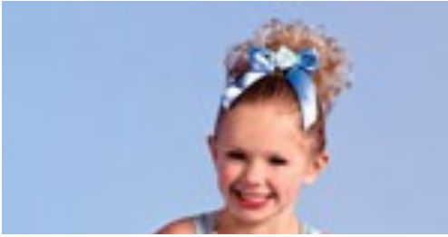
High pony tail, curled