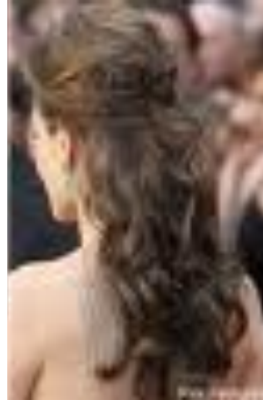
Pollyanna hair style, - NO fringe please, but rest of hair should be very curled