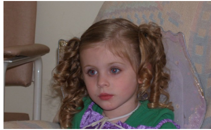
Two High curly pigtails