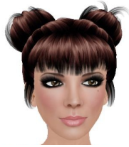
2 high piggy tail buns NO FRINGE PLEASE